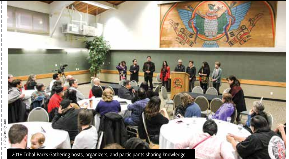
2016 Tribal Parks Gathering hosts, organizers, and participants sharing knowledge.

It was an honour to be invited to participate in the 2016 Tribal Parks Gathering hosted by the inspiring peoples of Tla-o-qui-aht First Nation in the Clayoquot Sound UNESCO Biosphere Reserve within Tla-o-qui-aht Tribal Parks. Assembled were many First Nations elders, leaders, cultural teachers, community organizers, and environmental protectors. These powerful change-makers journeyed from as far north as the mighty Peace River region of Treaty 8 through to the central north coast of California, and central Canada. All have contributed to or are engaged within a growing movement reclaiming Indigenous rights and responsibilities for traditional land stewardship.