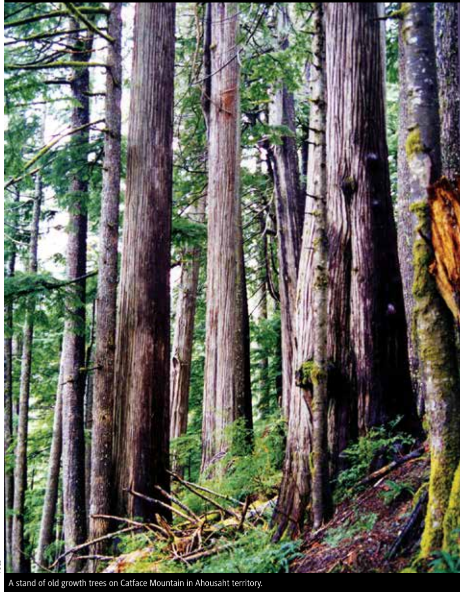
A stand of old growth trees on Catface Mountain in Ahousaht territory.