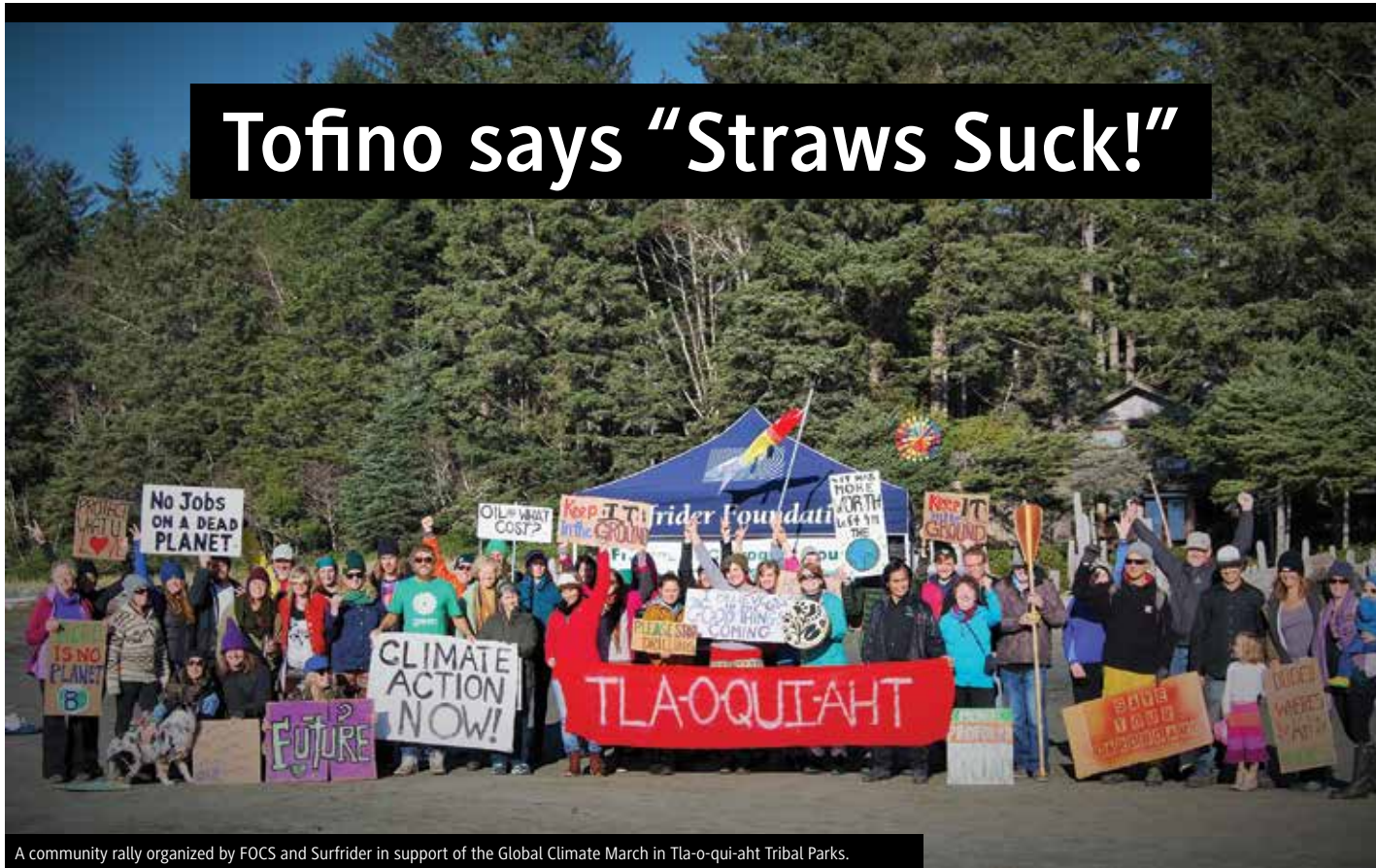
A community rally organized by FOCS and Surfrider in support of the Global Climate March in Tla-o-qui-aht Tribal Parks.