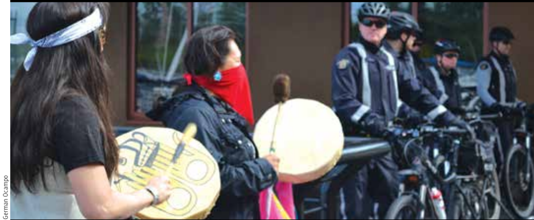
Imperial No More land defenders at the 2016 Imperial Metals AGM singing the Women's Warrior Song.