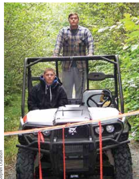
Members of Hesquiaht First Nation blocking logging equipment from moving into their territory.