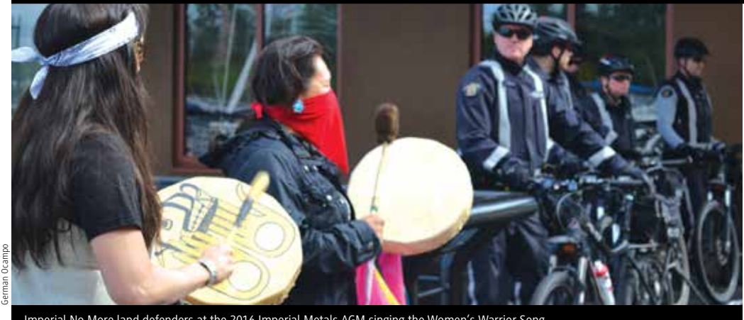
mperial No More land defenders at the 2016 Imperial Metals AGM singing the Women's Warrior So