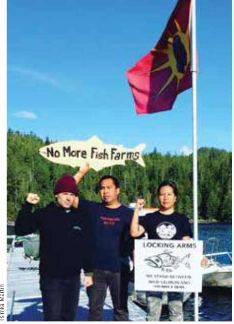
Friends of Clayoquot Sound supporting the Warriors for Yaakswiis during the action to evict Cermaq's fish farm from Ahousaht Territory.